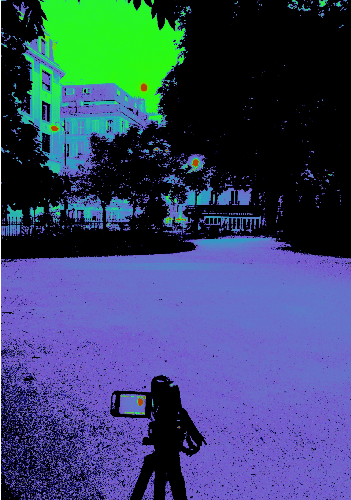
(waxing gibbous moon)